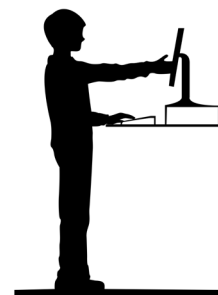
Standing work station recommended position

As with sitting, it is recommended to break this position regularly (every 45-60 mins at least) to sit down and/or stretch.